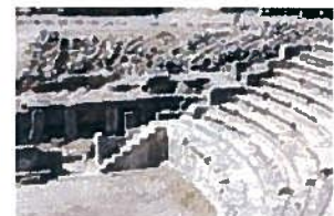
More of the Theater