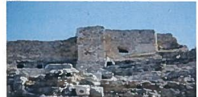
The Great Theater