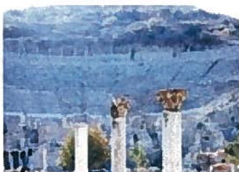
The Great Theater