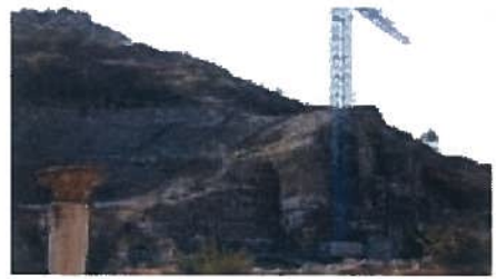
The Great Theater