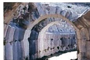
Top of the Theater